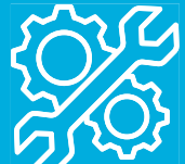
Engineering & Manufg