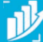
Investment & Shares