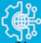
IT & ITES