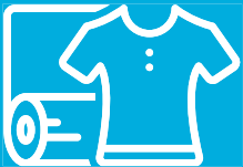
Textile & Garments