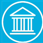
Banking & Finance