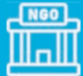
NGOs & charities