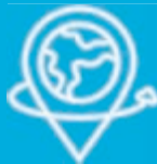
Travel & Tourism