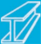
Iron & Steel