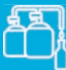
Distillery & Liquor