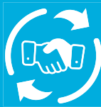
Trading & Dealership